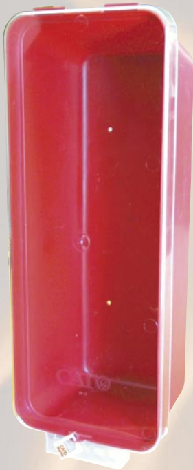
Warrior 95-5 Red Body/Clear Cover