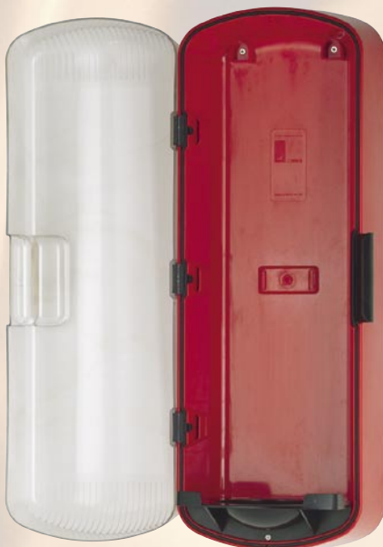
TS-101 Extinguisher Cabinet